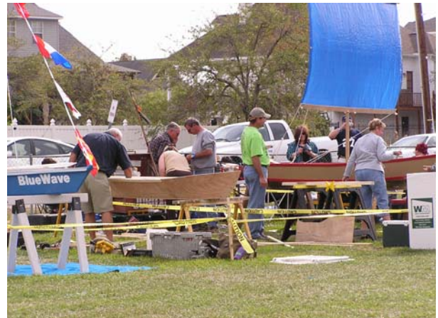
Other contestants in the Quick and Dirty on Sunday morning